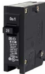
BR Thermal Mag