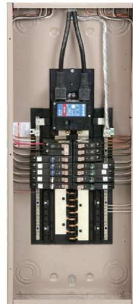
CH Plug-On Neutral