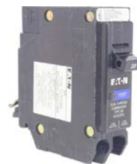
BR Plug-On Neutral Dual Purpose