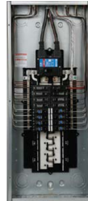
BR Plug-On Neutral