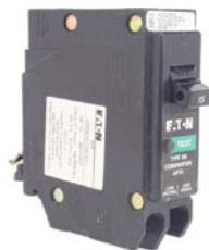
BR Plug-On Neutral Arc Fault